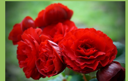
Baladin (Intense Red)