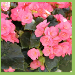
Dragone Evening Glow (Pink)

Rieger begonia (Begonia x hiemalis) is a hybrid begonia variety characterized by broad, glossy leaves and showy rose-like blooms available in orange, red, yellow, pink and white. Riegers prefer filtered light when outdoors and bright, indirect light as an inside houseplant.