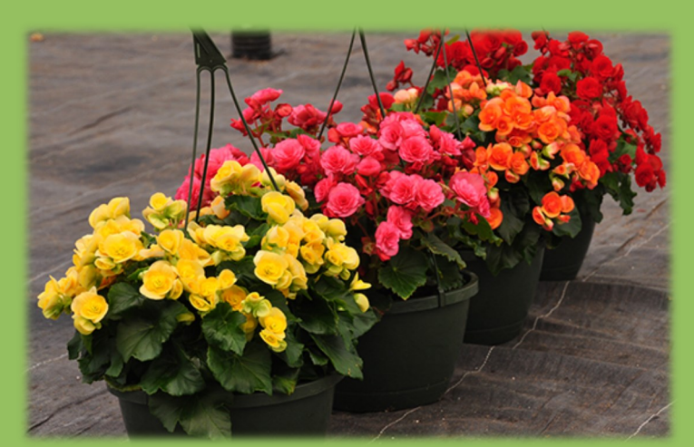
10" Hanging Basket Amstel Blitz, Netja Dark, Carneval, Barkos