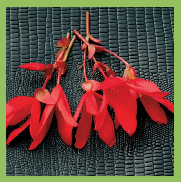
Bossa Nova Red