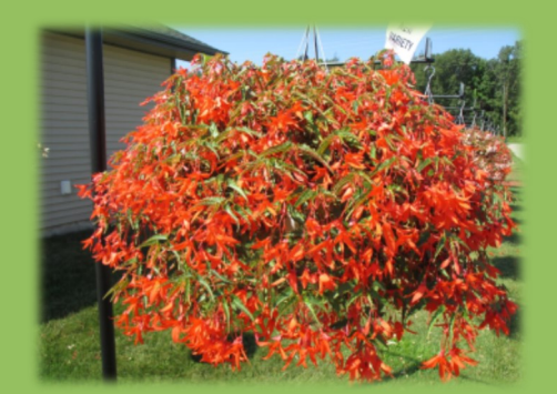
Bossa Nova Red