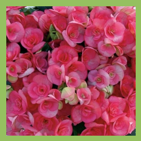
Am. Netja Dark (Pink)