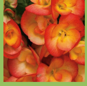
Am. Carneval (Yellow/Red)