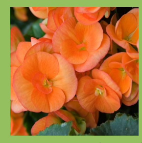
Amstel Dark Britt (Orange)