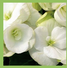
Amstel Clara (White)