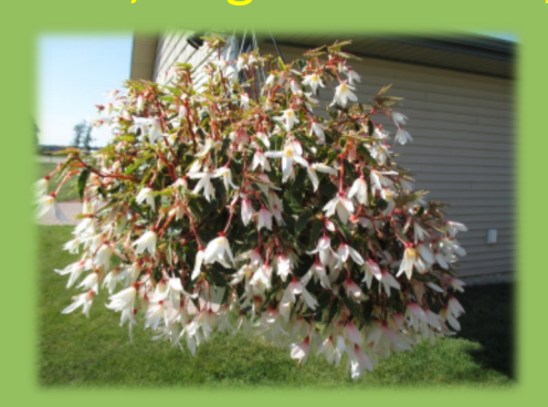
Bossa Nova Pure White