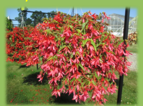
Bossa Nova Rose