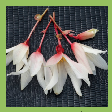
Boss Nova Pure White