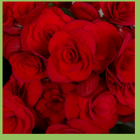
Baladin (Intense Red)