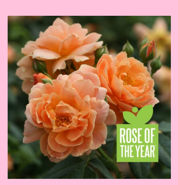
Rosa At Last

1.5-2.5FT Tall & Wide Long Blooming Disease Resistant No Deadheading Bloom Time: Spring-Fall Hardy to Zone 5