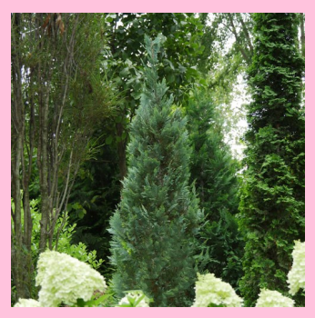
Chamaecyparis PinPoint Blue

False Cypress--Naturally grows as a narrow column. Feathery blue foliage Full to Part Sun 15-20 FT Tall; 3-5FT Wide No Pruning Deer Resistant Evergreen Hardy to Zone 5