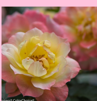
Rosa Italian Ice

Supersized flowers on a petite plant. Full Sun 2 FT. Tall & Wide Long Blooming Fragrant Attracts Butterflies Deer and Rabbit Resistant Bloom Time: Summer-Fall Hardy to Zone 5