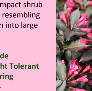
Weigela Spilled Wine

Fantastic color, wider -than tall, mounded habit. Deep burgundy foliage. Full Sun 2-3 FT Tall & Wide Petite Shrub Deer Resistant Pink Flowers Bloom Time: Late Spring Hardy to Zone 4