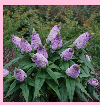
Buddleia Pugster Amethyst

Supersized flowers on a petite plant. Full Sun 2 FT. Tall & Wide Long Blooming Fragrant Attracts Butterflies Deer and Rabbit Resistant Bloom Time: Summer-Fall Hardy to Zone 5