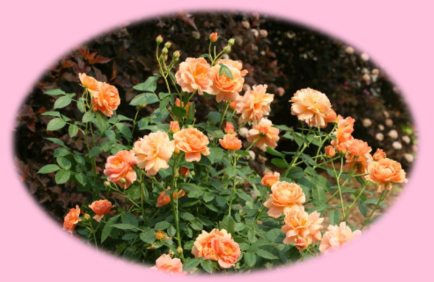
Rosa At Last

Fantastic color, wider -than tall, mounded habit. Deep burgundy foliage. Full Sun 2-3 FT Tall & Wide Petite Shrub Deer Resistant Pink Flowers Bloom Time: Late Spring Hardy to Zone 4