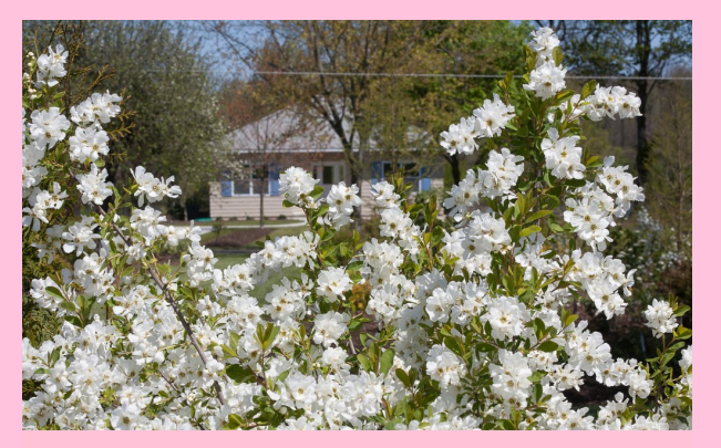
Offered in 1 Gallon PW Branded Pots

False Cypress--Naturally grows as a narrow column. Feathery blue foliage Full to Part Sun 15-20 FT Tall; 3-5FT Wide No Pruning Deer Resistant Evergreen Hardy to Zone 5